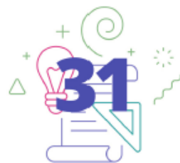
State ILP plans