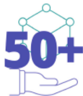
School and district CCLR scopes and sequence implementation plans