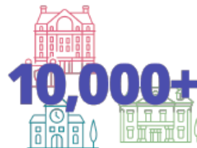
Successful school and district implementations