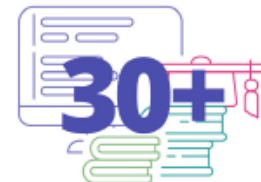
Peer-reviewed research studies