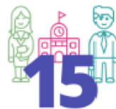
School and district leaders