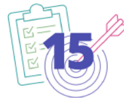
Approved ESSA plans