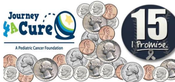
5 th Grade Coin Drive benefiting Journey 4A Cure and iPromise15

Collection jugs available each morning at arrival time. Donated money benefits Journey4ACure and iPromise15.