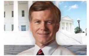
Governor Bob McDonnell