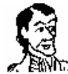
Senator James Monroe (friend to Madison, Jefferson; Republican president 1817-25)