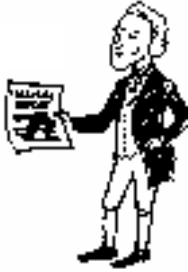
Alexander Hamilton’s Views

By the election year of 1792, Hamilton and Jefferson headed rival political parties to enact their views.