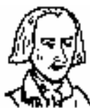
Congressman James Madison (co-leader of Republicans; Republican president, 1809-17)