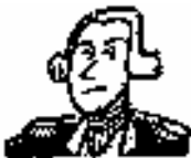
President George Washington (tried to remain neutral but leaned toward the Federalists)

Warring France and Britain violated America's neutrality by interfering with her shipping. Federalists, fearing French "mobocracy," favored Britain. Republicans, fearing monarchists, favored France.