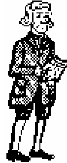
Thomas Jefferson’s Views