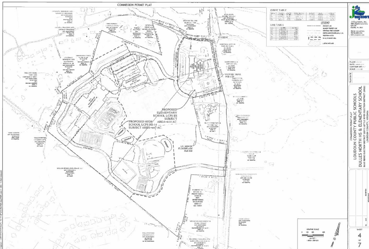
COMMISSION PERMIT PLAT

The expanded stadium and gymnasium capacities are a first of their kind for LCPS and are planned to host future regional events. The proposed Elementary School will be up to 120,000 sq. ft. in size with a student capacity of 960 students. Each school will have associated parking and recreation fields.