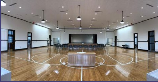
The Historic Douglass HS Education & Development Campus