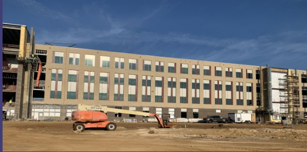
Watson Mountain MS (MS-14)