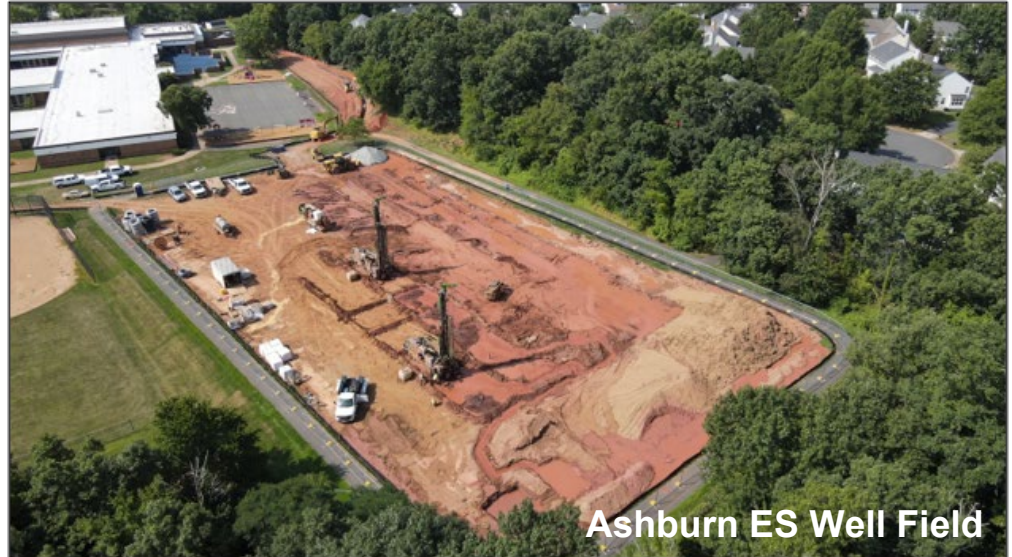
Ashburn ES Well Field

1st & 2nd Place – 2021 ENERGY STAR Decarbonize Your Design Challenge (Commercial New Construction)