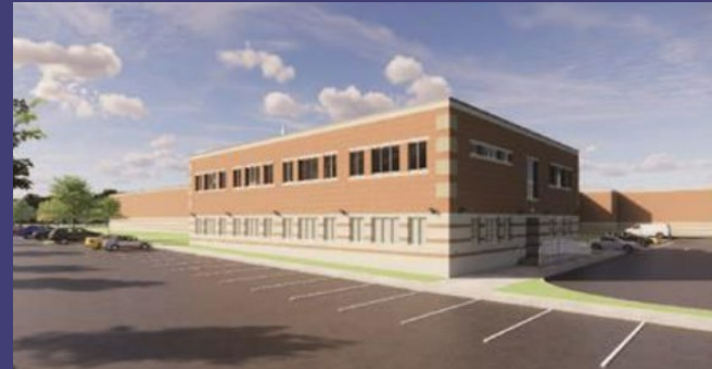
Briar Woods HS Classroom Addition