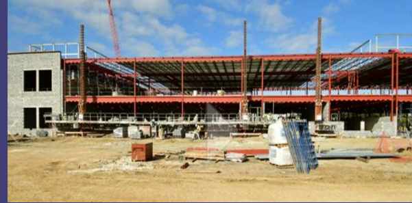
Henrietta Lacks ES (ES-32)