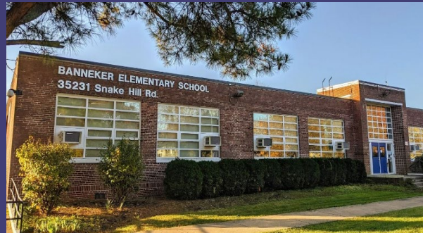
Banneker ES Renovation/Addition