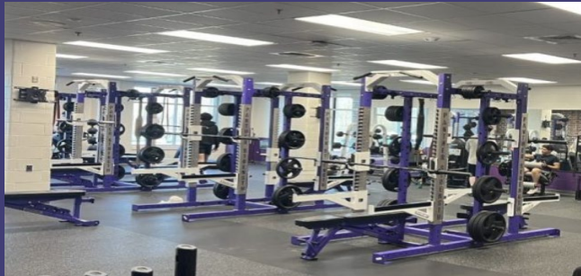
Potomac Falls HS Weight Room