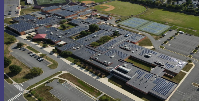
Broad Run HS Solar Array