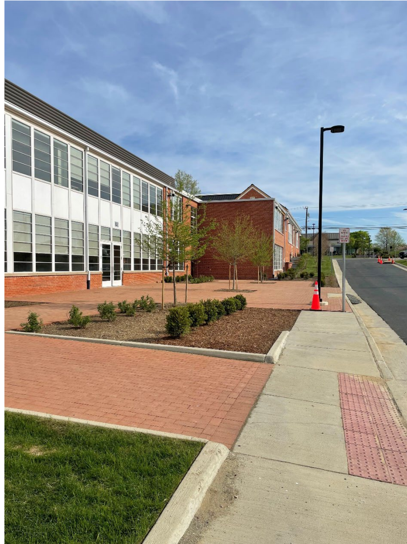
VIEW OF EAST COURTYARD LANDSCAPING APRIL 14