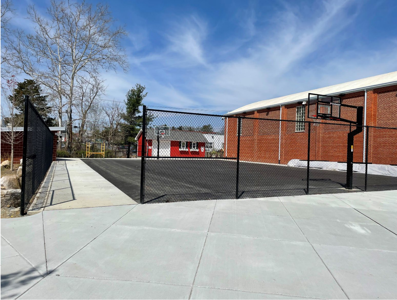
FENCING AT BASKETBALL COURT APRIL 14