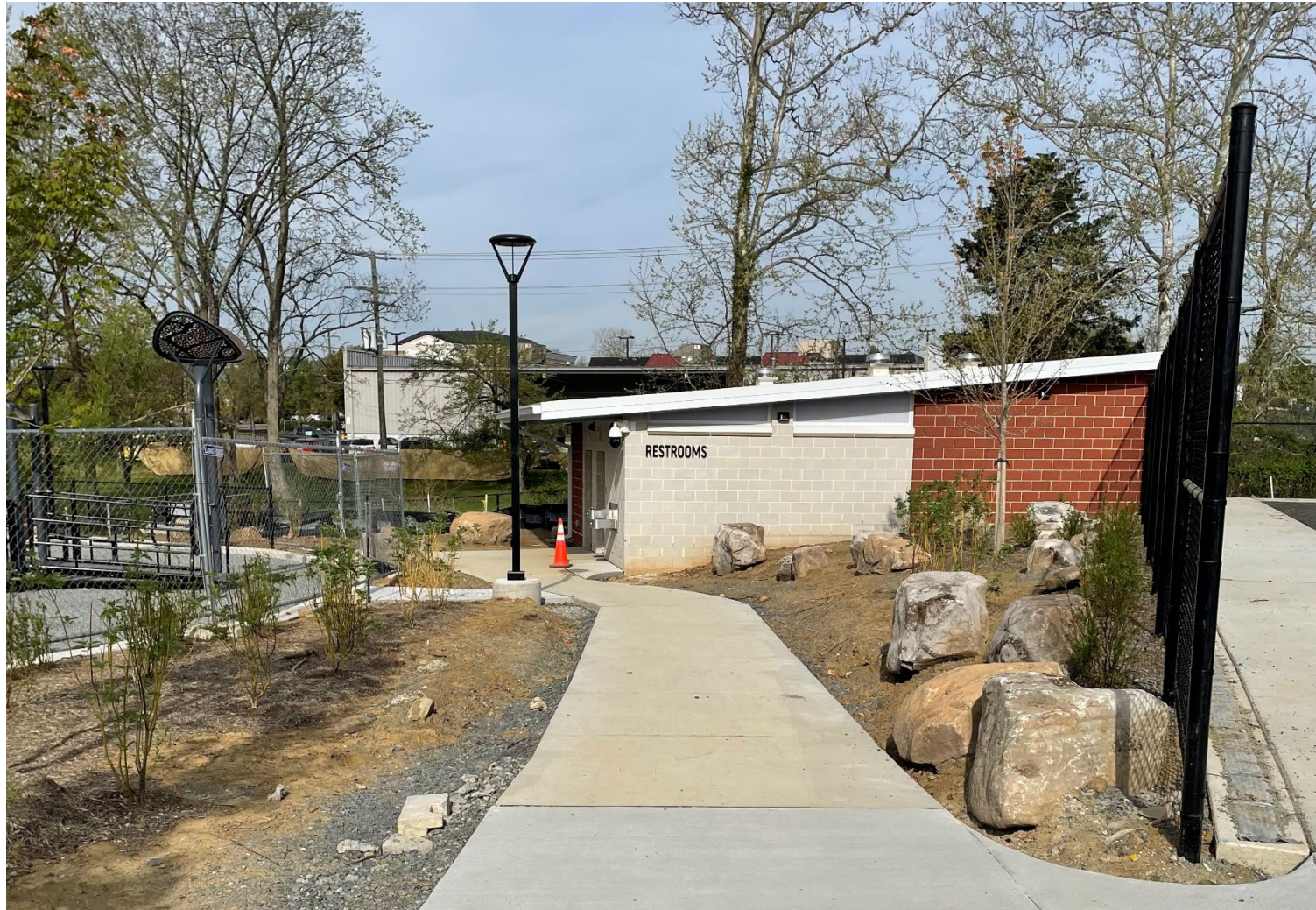
RESTROOM BUILDING APRIL 14