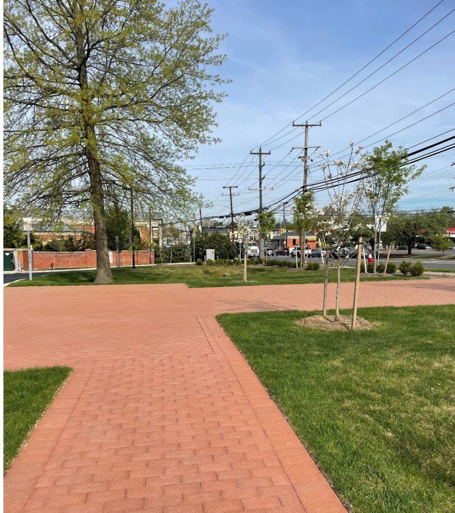
VIEW LOOKING WEST THROUGH FRONT PLAZA APRIL 14