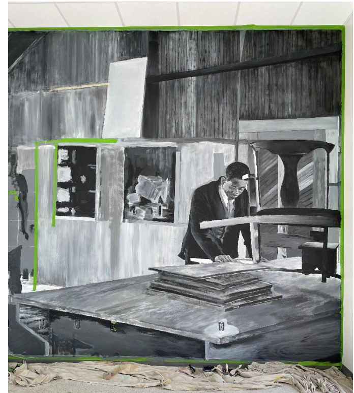
SHOP & BAND BUILDING MURAL APRIL 14