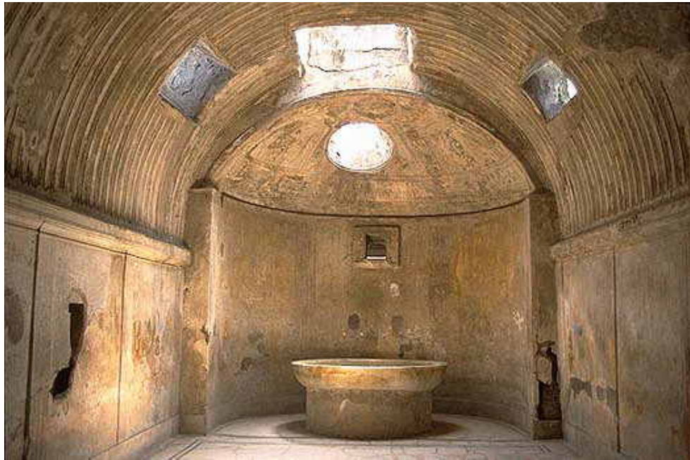
Bath Caldarium at Pompeii

http://eaglesanddragonspublishing.com/ancient-everyday-time-for-a-bath/ (citation)