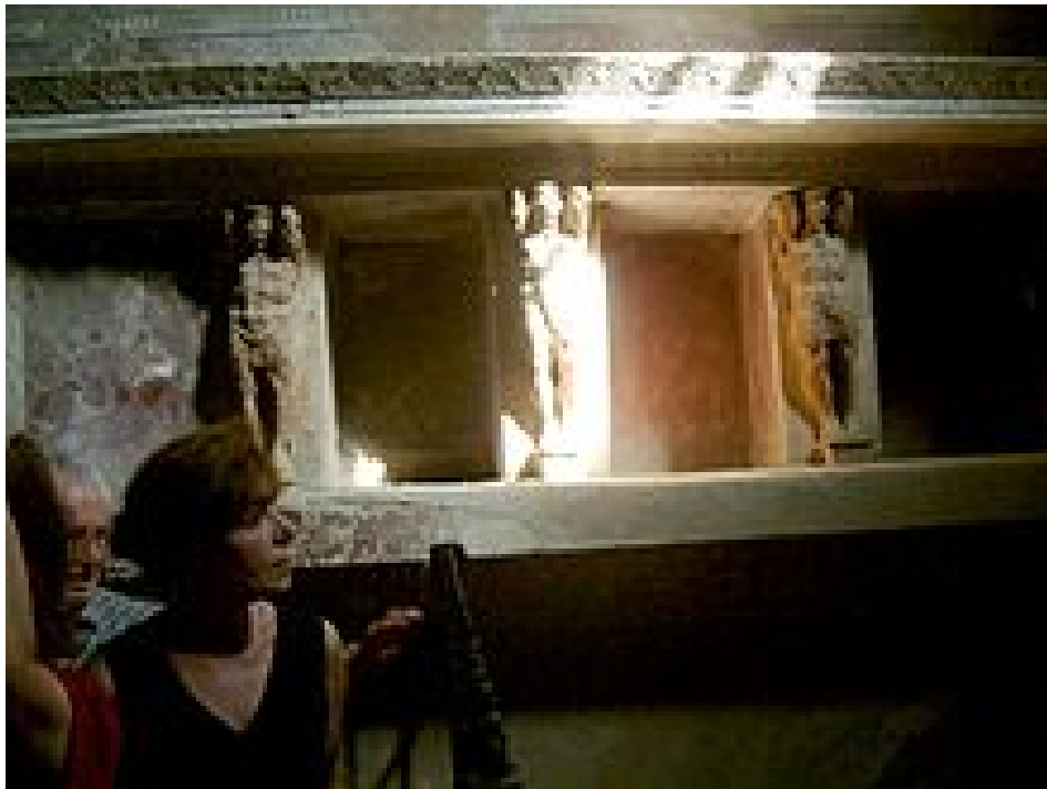
The Tepidarium of the thermae in the Pompeii

Roman Baths have separate baths for men and women.