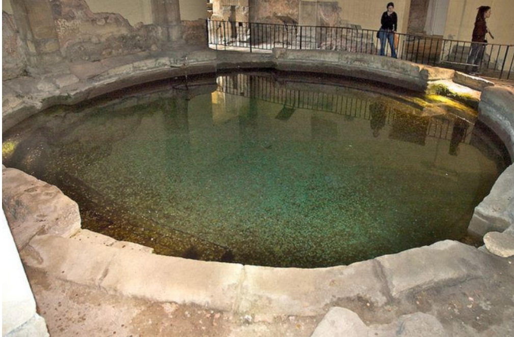
The Frigidarium of a Roman Bath

http://eaglesanddragonspublishing.com/ancient-everyday-time-for-a-bath/ (citation)